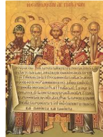
Fathers of 1 st Ecumenical Council

Keep up on OCA news by visiting www.oca.org , diocesan news by visiting www.nynjoca.org , and parish news by visiting www.occa-brick.org .