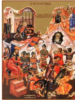
14,000 Infants slain by Herod at Bethlehem