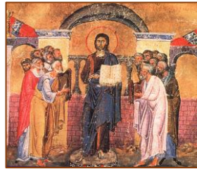
Church New Year (Indiction)

Gospel: Matthew 18:23-35 and Luke 10:38-42, 11:27-28