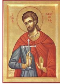
Martyr Callinicus of Gangra in Asia Minor