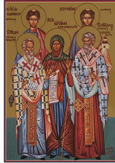
Holy Apostles of the Seventy and Deacons