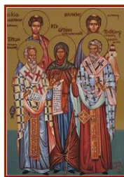
Holy Apostles of the 70 – Deacons Prochorus, Nicanor, Timon, and Parmenas

Please pray for vocations to the Holy Priesthood!