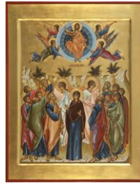
The Ascension of Our Lord

Epistle: Acts 2:1-11 Gospel: John 7:37-52, 8:12