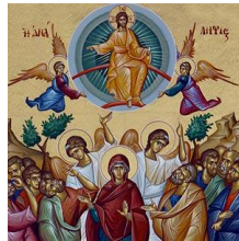
The Ascension of Our Lord

The Distinguished Diocesan Benefactors program is an essential vehicle for funding the activities and programs of our diocese. Please consider participating in the program. Brochures are located by the bulletin board in the parish hall or at the diocesan website at www.nynjoca.org .