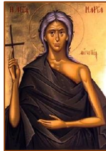
St. Mary of Egypt

The Distinguished Diocesan Benefactors program is an essential vehicle for funding the activities and programs of our diocese. Please consider participating in the program. Brochures are located by the bulletin board in the parish hall or at the diocesan website at www.nynjoca.org .