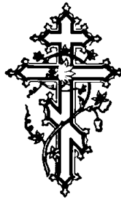
The Holy Precious and Life-giving Cross

Gospel: Mark 9:17-31 and Matthew 4:25-5:12