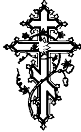
Veneration of the Cross

We are happy that you have joined us for worship today and hope that you will join us for Coffee Hour after the veneration of the Cross. The reception of the Holy Eucharist is only for baptized members of the Orthodox Church who have prepared with prayer, fasting, and periodic confession. You are encouraged to receive the blessed bread that is offered at the end of the service and which may also be offered to you by one of your neighbors during Communion.