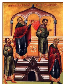
Sunday of the Publican and the Pharisee

Keep up on OCA news by visiting www.oca.org , diocesan news and directives by visiting www.nynjoca.org , and parish news by visiting www.orthodoxbrick.org .