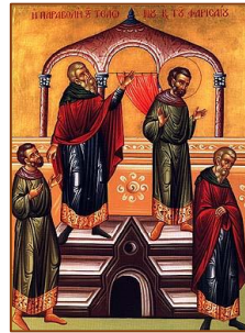
The Publican and the Pharisee

Please pray for vocations to the Holy Priesthood!