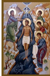
The Theophany of Our Lord and Savior Jesus Christ

The Distinguished Diocesan Benefactors program is an essential vehicle for funding the activities and programs of our diocese. Please consider participating in the program. For more information, please visit the diocesan website at www.nynjoca.org .