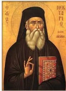
St. Nectarios of Pentapolis

Gospel: Luke 10:25-37 and Matthew 9:9-13