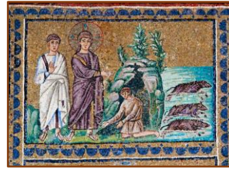
The Gadarene Demoniac

Keep up on OCA news by visiting www.oca.org , diocesan news by visiting www.nynjoca.org , and parish news by visiting www.occa-brick.org .