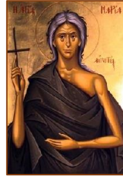
St. Mary of Egypt

The Distinguished Diocesan Benefactors program is an essential vehicle for funding the activities and programs of our diocese. Please consider participating in the program. For more information, please visit the diocesan website at www.nynjoca.org .