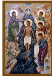
The Theophany of Our Lord and Savior Jesus Christ

Keep up on OCA news by visiting www.oca.org , diocesan news by visiting www.nynjoca.org , and parish news by visiting www.occa-brick.org .