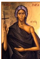
St. Mary of Egypt

Please pray for vocations to the Holy Priesthood!